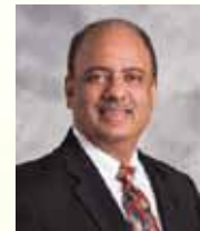
Past RI President SHEKHAR MEHTA Guest of Honor